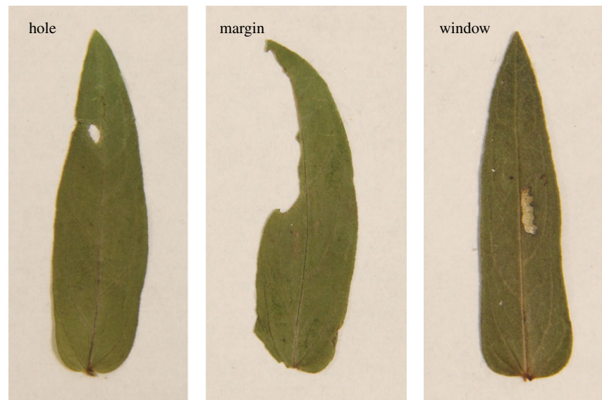
Figure 2. Different types of damage found on purple loosestrife herbarium specimens ( Lythrum salicaria ) in Quebec (Canada): hole, margin or window.